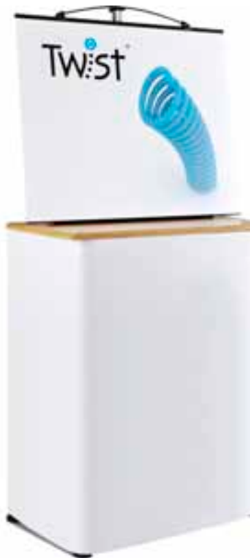
Twist Counter sold separately