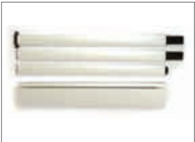
Base and Uprights

The Twist Travel has been developed to offer a lightweight alternative without compromising quality or aesthetics. By using our unique aluminum upright and base profiles the Twist Travel hardware and graphic can be packed into just one small Bag weighing just 4.6kilos complete. If required, the Twist Travel can be linked together using an Easi-Link Kit. Lights are available as an optional extra.