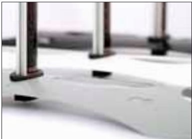
Range of Bases