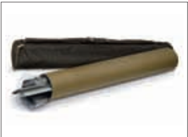
Hardware & Graphic Carry Case