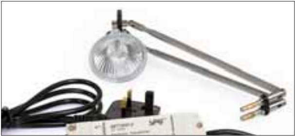
Light & Transformer