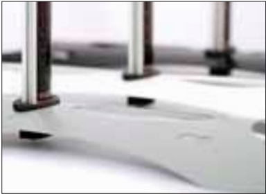
Range of Bases