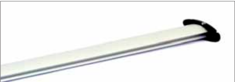
Single Piece Upright

PLEASE NOTE: Twist Retail comes as standard without light capabilities and is supplied as a base in Box with upright packed in a 2.1m tube.